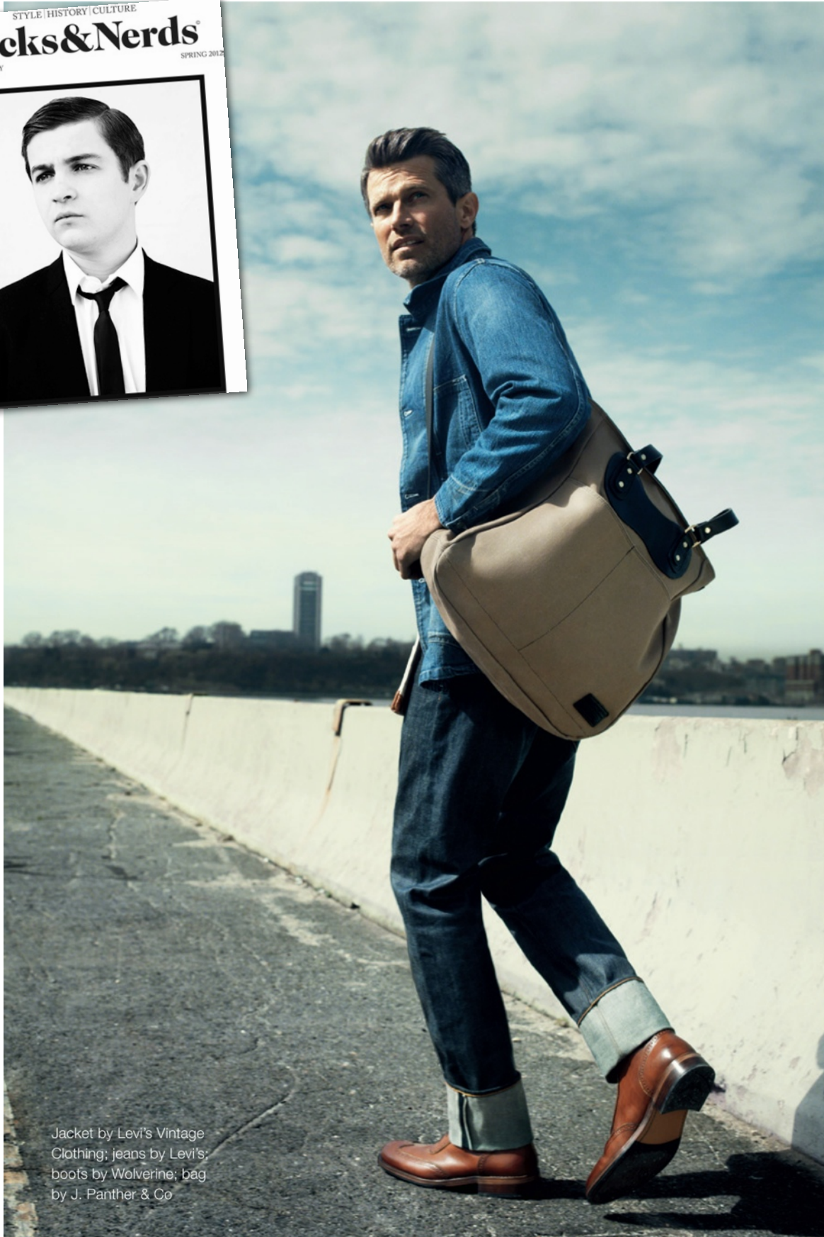
Jacket by Levi's Vintage Clothing; jeans by Levi's; boots by Wolverine; bag by J. Panther & Co