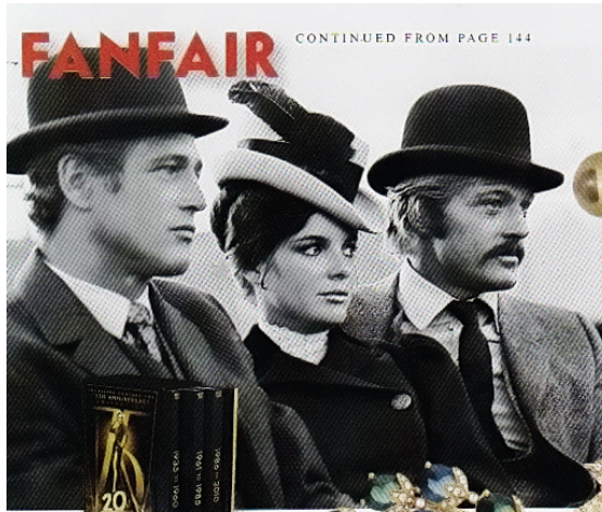
FANFAIR CONTINUED FROM PAGE 144

MOVIE NIGHT ▲ 20th Century Fox 75th Anniversary Collection boxed set contains 75 classic movies from 1935 to 2010; $375. (amazon.com)